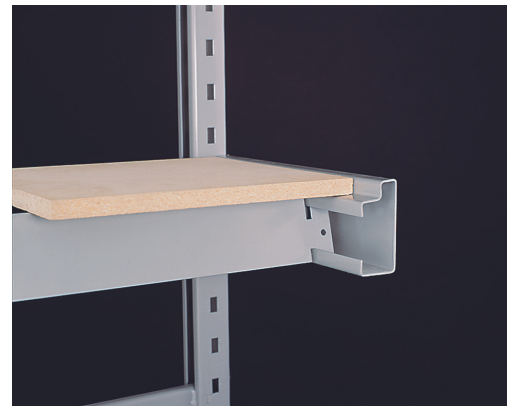
Heavy Duty Plywood Beams