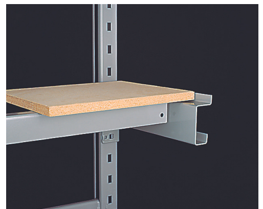
Standard Plywood Beams