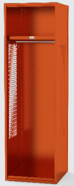
Welded w/ Shelf

NOTE: Only an option on models equipped with a Security Box