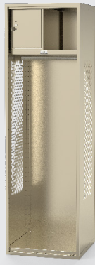
Welded with Shelf & Security Box