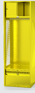
Welded with Shelf, Security Box & Footlocker